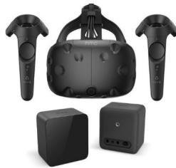
Fig. 1. Picture of all components from HTC Vive Set [61]

When on the market, there was inexpensive virtual reality equipment that allows research into which the researcher can conduct observations of naturally moving objects. One known such system is HTC Vive, which includes goggles which serve as a display from a computer and besides tracking systems in a designated room. It is all at a reasonable price if the sophisticated tracking precision and sufficient accuracy allow this device to be used for many tests [60]. Fig.1 represents HTC VIVE set. This set contains HTC goggles, two pads and adapters. Adapters track the movement of goggles and pads and send information to the computer. Goggles and pads allow interacting with a virtual environment. The operation of viral graphics consists of the integration of images from graphics sounds from the program and other sensory data such as a plugin with gloves in real-time into one virtual world. The best thing is that the user can feel most things when interacting with a given object. The image from the virtual world is transmitted by the head-mounted display set (HMD).