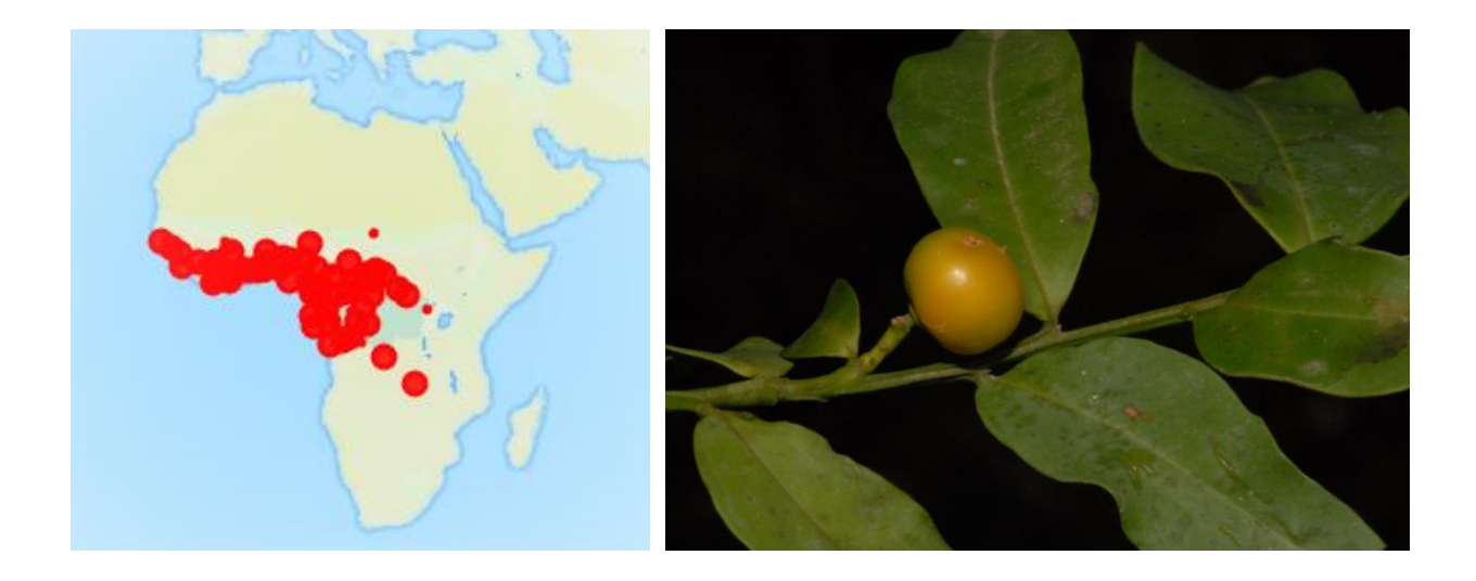
Figure 1. Geographical distribution (African Plant Database, 2022) and appearance of O. subscorpioidea Oliv. (Brunken et al., 2008)

O. subscorpioidea grows in most of the West and Central African countries (Figure 1). It can be found in Senegal, Nigeria (Ayandele & Adebiyi, 2007), Cameroon, Côte d'Ivoire, and the Democratic Republic of the Congo (Kazeem et al., 2015).