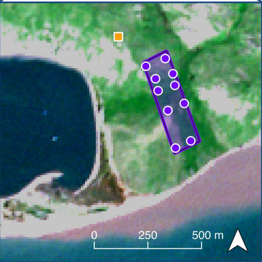
Fig. 1 A map showing the location of Qikiqtaruk (69.57 °N, 138.90 °W) within Canada and Sentinel 2 false-colour images showing the location of the transects on Qikiqtaruk. The purple dots represent the ends of the five transects, and the purple box shows the area within which all samples were taken. The orange square shows the location of the phenology plots

from the base of the thickest stem of 6–8 individuals each along five parallel transects on the Qikiqtaruk floodplain in July 2016. Individuals were at least 10 m apart and transects were 50–100 m apart to lower the risk of sampling clones, particularly given the sprawling prostrate growth form of S. arctica (Argus 2007).