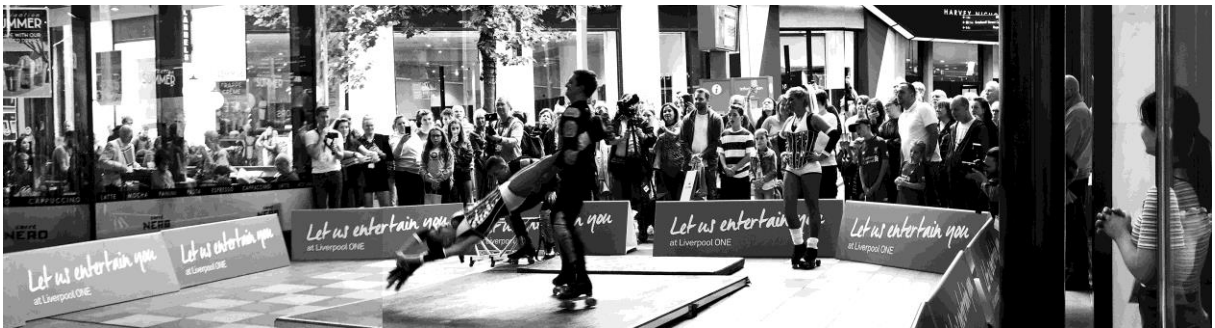
Fig 12 Skaters in Liverpool One celebrating two-hundred and fifty years of the Blackpool Circus.

Liverpool One is, of course, a "privately owned public space," now referred to as "Pops" these have been "popping" up in cities throughout the United Kingdom and present some serious questions in terms of our urban liberties and associated urban behaviour patterns. "Pops" are a mechanism through which cash strapped "Local Authorities" encourage developer investment, and consequently "pop goes the weasel!"<sup>42</sup> They are especially numerous in London and usually have different rules than publicly owned urban spaces which is tricky as often you don't know that you are in one and don't know when or how you should amend your behaviour. Liverpool One is similar; there are no gates and / or boundaries between its thirty-five privatised streets and its surrounding context. Is it different? Well, yes; it is, although the differences are subtle. Skateboarding and cycling are discouraged, as are beggars and homeless people, there are no delivery trucks in the day, ambulances are escorted in and it is noticeably cleaner even on approach through the surrounding streets. There are also apparently four hundred cameras<sup>43</sup> and a large private security presence in the form of the redcoats who frequently intervene to reduce urban dissent. You can apparently busk in nine locations, but all of the performances are either organised by Liverpool One management or they tend towards middle class worthy charitable causes.