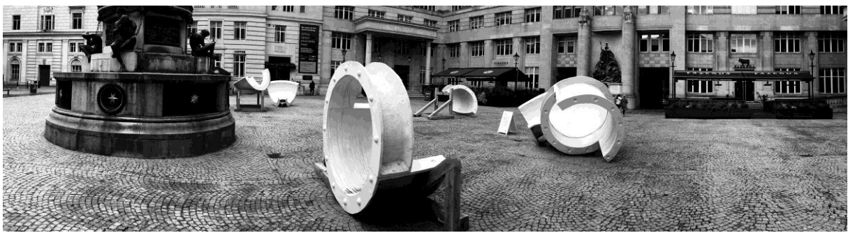
Fig 7 Biennial Liverpool; Cenotaph 2018 sculpture in Exchange Flags, by Holly Hendry

Even art in Liverpool developed into a popular cultural event in the form of the Biennial. The Tate a London based modern art gallery, initiated a branding of itself through satellite galleries across the United Kingdom. Liverpool's Tate of the North became one of these initial satellites in1988. The Biennial was initiated a decade later by a number of creatives from Liverpool's Tate who foresaw art as a popularised urban event taking art out of the galleries and into the city scape. The first Biennial was in 1999 running in alternating years, as its name implies, inviting renown international contemporary artists to create art within the city's urban matrix. Liverpool's Biennial has five hundred thousand visitors over a ten-week period and remains one of the largest contemporary international art events in the United Kingdom.