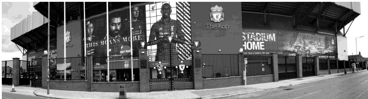
Fig 6 Anfield Stadium 'HOME' of Liverpool football club, hosting operas of two halves