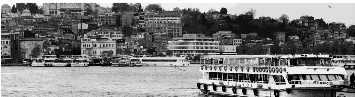
Fig1 Istanbul one of the most well-known confluences where East meets West

Excess is rarely considered an asset, however Georges Bataille discusses the abundance of light as an excess of energy that can be used for growth: "Solar energy is the source of life's exuberant development. The origin and essence of our wealth are given in the radiation of the sun which dispenses energy- wealth- without return."<sup>1</sup> Nature responds generously to the gift of surplus solar energies and develops in excesses on a cyclic basis. Nature is superabundant and we are dependent on the flowing exchange of its excessive product. As custodians of nature we utilise these excesses for our benefit and our confluences of edge-exchanges of these excesses have tended to develop into cities as an excessive concentration of our own cultural activities. Our cities have therefore become concentrations of exchanges and events that offer variety, ambiguity, the strange and unique as excessive event-mental ensembles.<sup>2</sup> They are continually emerging as a spatial and cultural maelstrom of complex historic and anticipated interpretive patterns forming a desirable landscape that embraces and enables its milieu to delve into its thickness reflecting, "man's most consistent and on the whole, his most successful attempt to remake the world he lives in more after his heart's desire."<sup>3</sup>