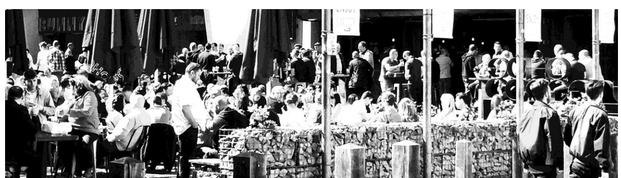
Fig 4 Concert Square in the Ropewalks, a strategic urban move enhancing the areas clubbing culture

Cream as a weekly music night at "Nation" in the 1990s became the biggest club night in Liverpool. As event, it saw three thousand revellers arriving, in baggy cloth's and bikinis, from all over the United Kingdom to partake in an all-night mass dance fest. Cream became a way of life for many revellers during this period and has now become a global brand with Amnesia, an internationally renowned dance trance club initiated in 1995 in Ibiza and Cream-fields, one of the largest international dance festivals, initiated in1998. Cream as an international brand currently organises over one-hundred events each year on an international scene and returns to Liverpool.... Occasionally!