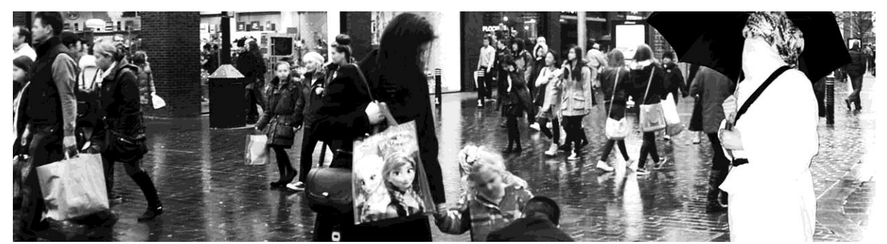
Fig 14 Stranger in Lord Street, dangerous and desirable positing a unique objectivity for reflection

Liverpool One could be said to be the success of excess, it's certainly popular, footfall each year has been over twenty-three million since 2009.<sup>50</sup> Strategically as a popular cultural activity, it complements the adjacent city areas of Ropewalks, the Central Business District, the Docklands and the Baltic Triangle creative quarter. This cumulative city centre of Liverpool has become a renewed destination of excessive popular cultural consumption as a twenty-four-seven hyperreal commodity. Liverpool One maybe a little sanitised, however the city centre holistically retains a village like feel, you can walk across it in twenty minutes, invariably meet someone you know and, well, you don't have to walk far to find a little "creative edginess" in the Baltic Triangle, or the North Docks though today the music scenes edginess is complemented by bio and computer sciences. The strange and unique have reappeared through innumerable international students and tourism: "The strange and unique which are both dangerous and desirable, they posit a unique objectivity for reflection."<sup>51</sup> This is assuming that we forget that we have given a large part of our city centre away for two hundred and fifty years to excessive profits. The cultural difference between mainly Middle Eastern investors and Liverpool One's users must be huge, but we have become inter-dependant in an investment venture for the next quarter of a millennium. "Loving the alien."<sup>52</sup>