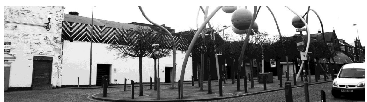
Fig 5 Nation, (Cream) Warehouses and sculpture "Penelope" Ropewalks Wolstenholme square 2016.

Cream as a weekly music night at "Nation" in the 1990s became the biggest club night in Liverpool. As event, it saw three thousand revellers arriving, in baggy cloth's and bikinis, from all over the United Kingdom to partake in an all-night mass dance fest. Cream became a way of life for many revellers during this period and has now become a global brand with Amnesia, an internationally renowned dance trance club initiated in 1995 in Ibiza and Cream-fields, one of the largest international dance festivals, initiated in1998. Cream as an international brand currently organises over one-hundred events each year on an international scene and returns to Liverpool.... Occasionally!