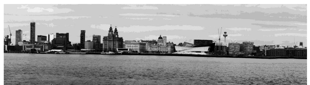
Fig 9 Panoramic of Liverpool's heritage waterfront with the three Graces central.

Grosvenor in rebuilding the city centre wanted to link into Liverpool's popular cultural brand. They initially approached the branding of their new city centre by creating six core aims, "Make new Rules. Involve Everyone. Love the City. Think Big. Create More. Be the Best."<sup>36</sup> Their objective was for their development to be integral with the city, its inhabitants and its branding by creating a link