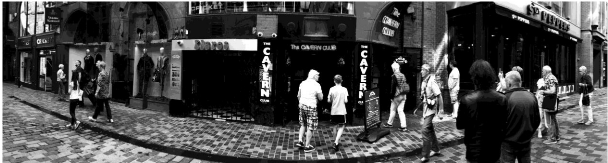
Fig 3 Mathew street Cavern Club demolished 1973 and rebuilt 1984 using the original cellar bricks

Go into any karaoke bar in the Far East and you can hear the Beatles songs being enthusiastically slaughtered every night by incongruous accents. Music, dance, food, drink, theatre, sport, art and film, together with a rich tough industrial tectonic heritage define the city's cultural character.