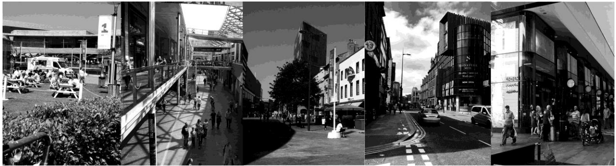
Fig 10 Five zones for diversity best described as Hill & Park, Valley, Boulevard, Street, Arcade

"brand" with commodity fetish and by devising the term "Liverpool One" they adopted and subsequently captured the entire city. Liverpool One as a phrase links to and captures the positive attributes of Liverpool's popular urban cultural pursuits as well as inferring it is number one for retailers and consumers.