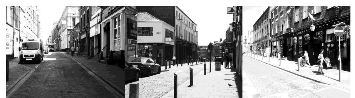
Fig 11 Ropewalks regeneration area developed by BDP one step ahead of the Liverpool One project