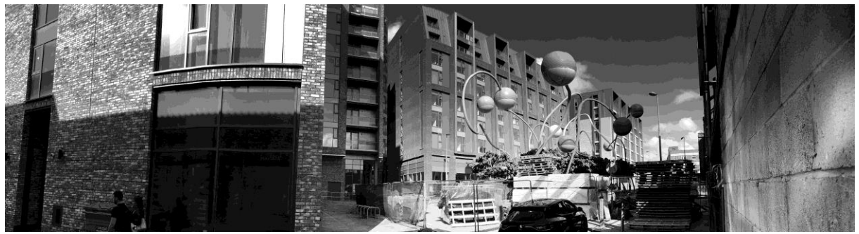
Fig 13 Wolstenholme square with sculpture "Penelope" as the remaining recognisable feature 2019

Liverpool One could be said to be the success of excess, it's certainly popular, footfall each year has been over twenty-three million since 2009.<sup>50</sup> Strategically as a popular cultural activity, it complements the adjacent city areas of Ropewalks, the Central Business District, the Docklands and the Baltic Triangle creative quarter. This cumulative city centre of Liverpool has become a renewed destination of excessive popular cultural consumption as a twenty-four-seven hyperreal commodity. Liverpool One maybe a little sanitised, however the city centre holistically retains a village like feel, you can walk across it in twenty minutes, invariably meet someone you know and, well, you don't have to walk far to find a little "creative edginess" in the Baltic Triangle, or the North Docks though today the music scenes edginess is complemented by bio and computer sciences. The strange and unique have reappeared through innumerable international students and tourism: "The strange and unique which are both dangerous and desirable, they posit a unique objectivity for reflection."<sup>51</sup> This is assuming that we forget that we have given a large part of our city centre away for two hundred and fifty years to excessive profits. The cultural difference between mainly Middle Eastern investors and Liverpool One's users must be huge, but we have become inter-dependant in an investment venture for the next quarter of a millennium. "Loving the alien."<sup>52</sup>