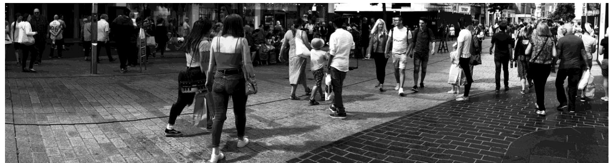
Fig 8 Lord Street Liverpool, objects as the new religion and retail therapy as its religious practice

"Liverpool One," started out as the Paradise Street project and was initiated prior to the Capital of Culture bid. Paradise Street had been identified as an area of huge potential as early as 1993. The 1998 report by Healey and Baker commissioned by the city, confirmed that Liverpool was dramatically short of retail space and was losing out to other nearby retail centres,<sup>31</sup> and much of the city centre remained underdeveloped from the war. The strategic ambition was to develop an excessive gravitational hub of retail and entertainment over forty-two acres in the city centre, rebuilding the city from the centre out. Shopping is of course a popular cultural pursuit and we still "devote considerable time and effort to foraging, although the context is now in malls, stores, and Internet sites;"<sup>32</sup> it's termed retail therapy.