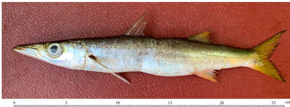
Fig. 2. Sphyraena chrysotaenia caught by small scale fisheries using trammel nets at the south-east borders of the National Marine Park of Zakynthos (Greece, Ionian Sea).