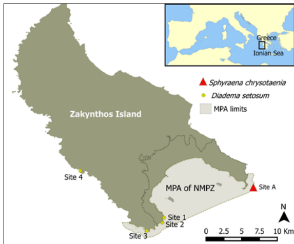
Fig. 1. Locations of records of Sphyraena chrysotaenia and Diadema setosum at Zakynthos Island (Ionian Sea, Greece). The limits of the National Marine Park of Zakynthos are also shown.

Island main port landing site (Figs. 1 and 2). The interviewed fisher brought these individuals to our attention upon realization that they differed from the native barracudas. According to the fisher, these individuals were captured by trammel nets (28 mm mesh size knot to knot) deployed at 30 m depth just outside the easternmost borders of the NMPZ (Fig. 1; Table 1). The col-