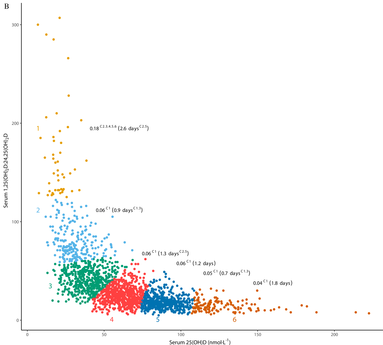
Fig. 1 (Continued)