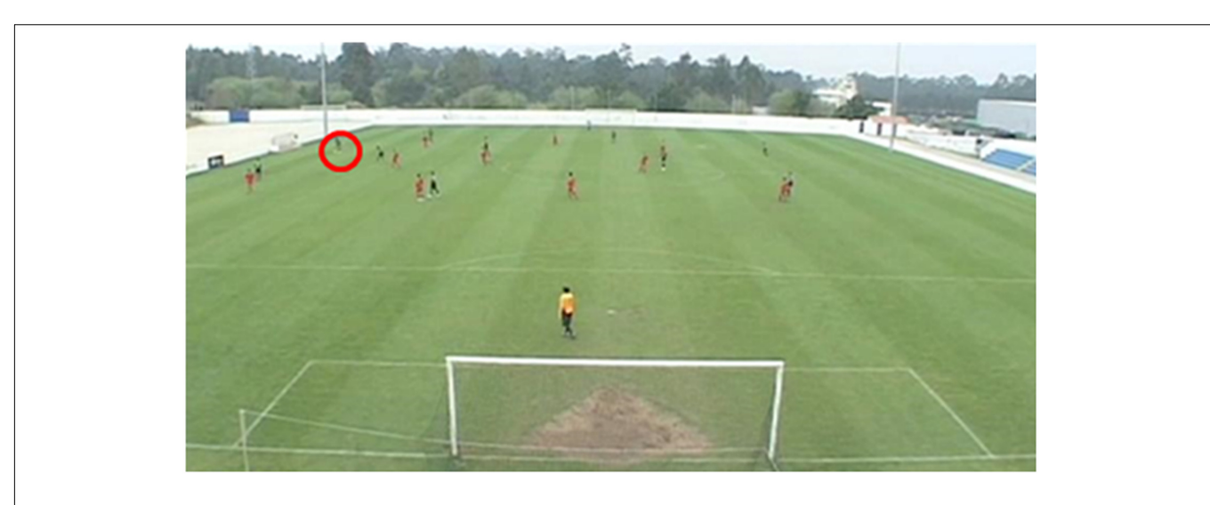
FIGURE 1 | An example of a freeze-frame shown prior to the onset of a clip with the starting position of the ball indicated by a red circle.