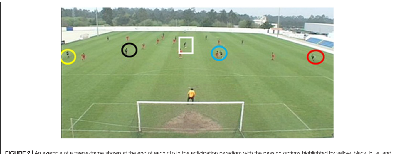
FIGURE 2 | An example of a freeze-frame shown at the end of each clip in the anticipation paradigm with the passing options highlighted by yellow, black, blue, and red circles. Note: White square shown here is for illustrative purposes to highlight ball location and was not used in the actual test film.

clips with an inter-trial interval of 5 s, with each training session taking approximately 20 min to complete. Participants were not required to make any responses during the training sessions, but they were informed to watch the clips and pay attention to any instructions or guidance provided within these session.