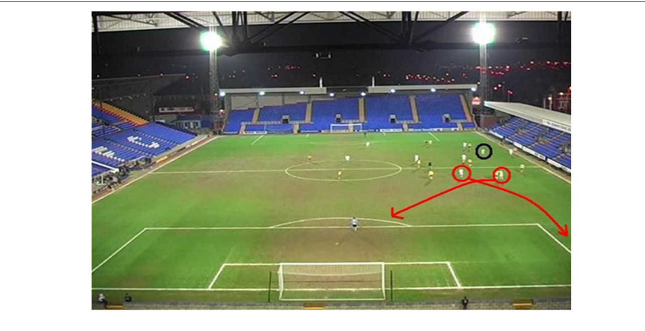
FIGURE 3 | An example of a freeze-frame from the visual attention intervention which highlights ball location and the position and subsequent movement of the two central attacking players.

black circle, participants in this group were cued as to the most important players and where they should direct their attention using red circles (to highlight the players) and red arrows (to highlight their movements). The visual cues to guide attention were all presented during the freeze-frame only so as to avoid potentially obstructing information once clips played normally. To ensure consistency, the same players were highlighted as in the verbal instruction group and each clip was played for the same length of time with the same number of freeze-frames inserted for the same length of time. An example of a freeze-frame from the visual guidance group is shown in Figure 3 .