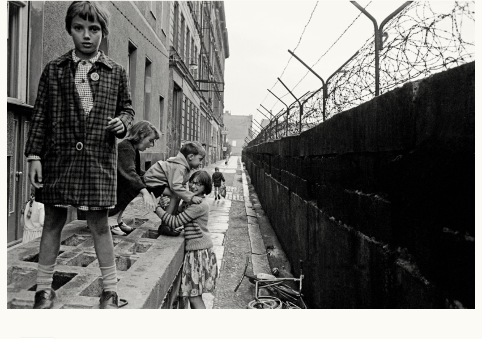
Leonard Freed — Children play on the west side of the Berlin Wall, West Berlin, 1961