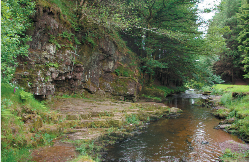
Plate 7 Glenville Mass Rock, County Cork