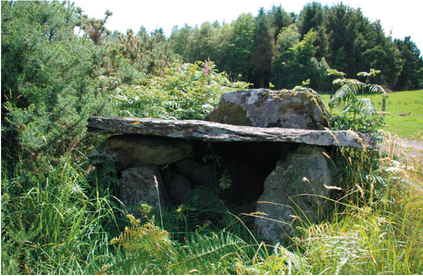
Plate 3 Derrynafinchin Mass Rock, County Cork