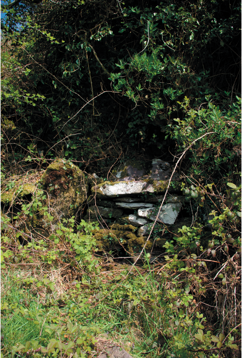
Plate 9 Kilnadur Mass Rock, County Cork