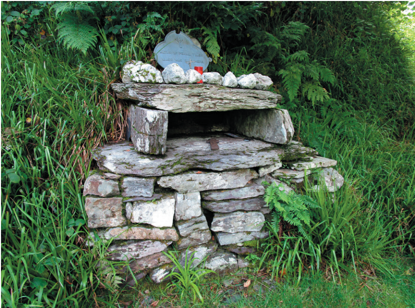
Plate 8 Curraheen Mass Rock, County Cork