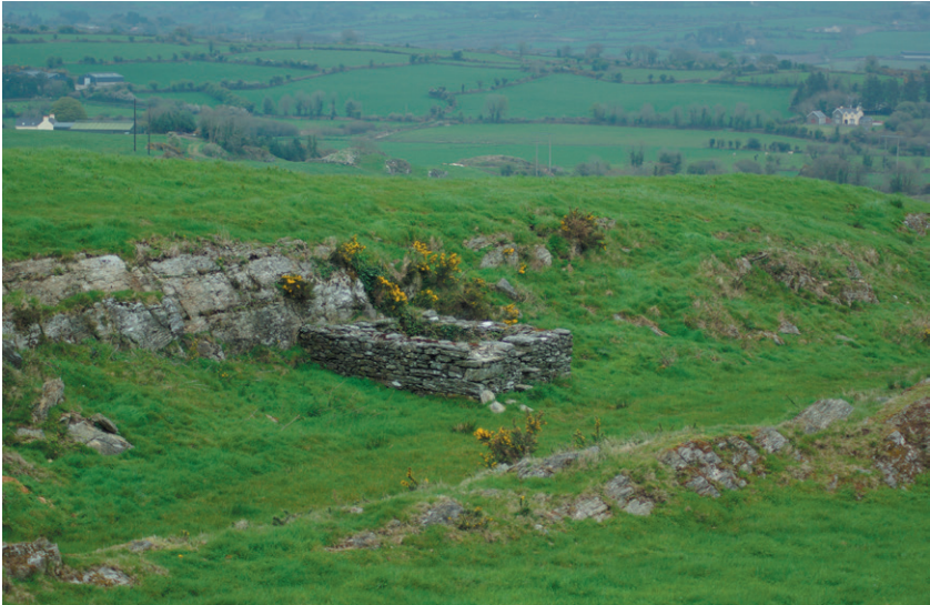
Plate 5 Gortnamuckla Mass Rock, County Cork