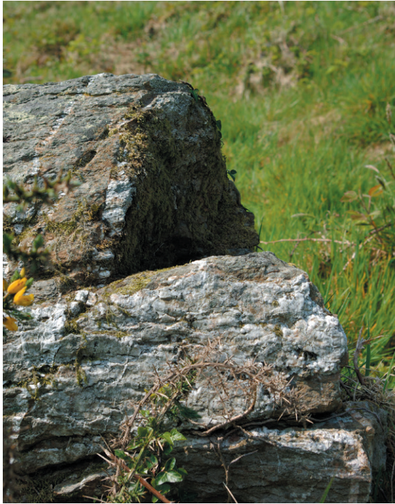
Plate 14 Ledge, Cullomane West Mass Rock, County Cork

It is possible that water sources such as streams and rivers may have been used as a way to guide the congregation to the Mass Rock site or, alternatively, to mask footprints that would otherwise have been identified by authorities eager to curtail the celebration of Mass. 65 Mass Rock sites close to the shoreline would have facilitated the arrival and departure of massing priests and such activities were acknowledged by the authorities in Cork and recorded in historical records such as the Report on the State of Popery 1731 66 . Indeed, Schull was one of the sites along the Cork coast where authorities had already identified priest landing by 1708. 67