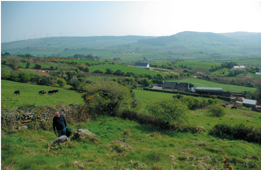
Plate 6 Rectangular loose stoned wall, Cullomane West Mass Rock, County Cork