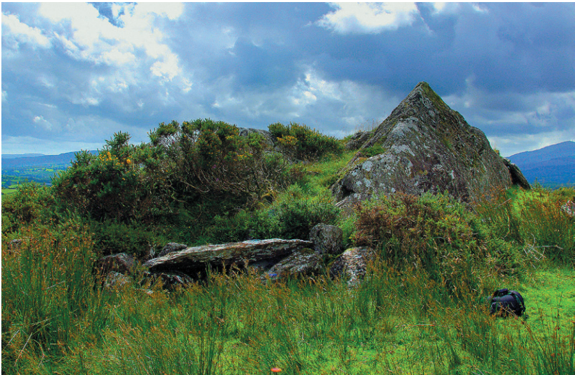
Plate 4 Gourtnaboughtee Mass Rock, also known as Carraig an tSéipeil, County Cork