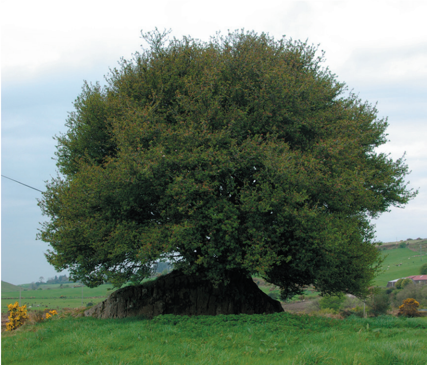
Plate 13 Ardrah Mass Rock, County Cork

In Analeentha townland, the Holy well of St John the Baptist was itself used as a place for open air Mass in Penal days (site notice). The Mass Rock in Mohonagh, Aughadown, is close to a blessed well that, according to local tradition, never runs dry. The Mass Rock has shelves that served as the altar in Penal days and, a short distance away, is a large stone believed to be a lookout post. 49