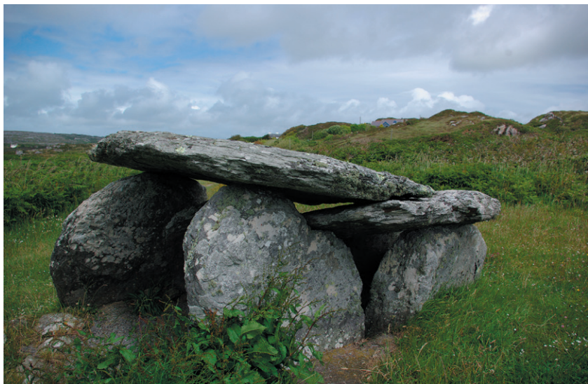
Plate 1 Altar Mass Rock, County Cork