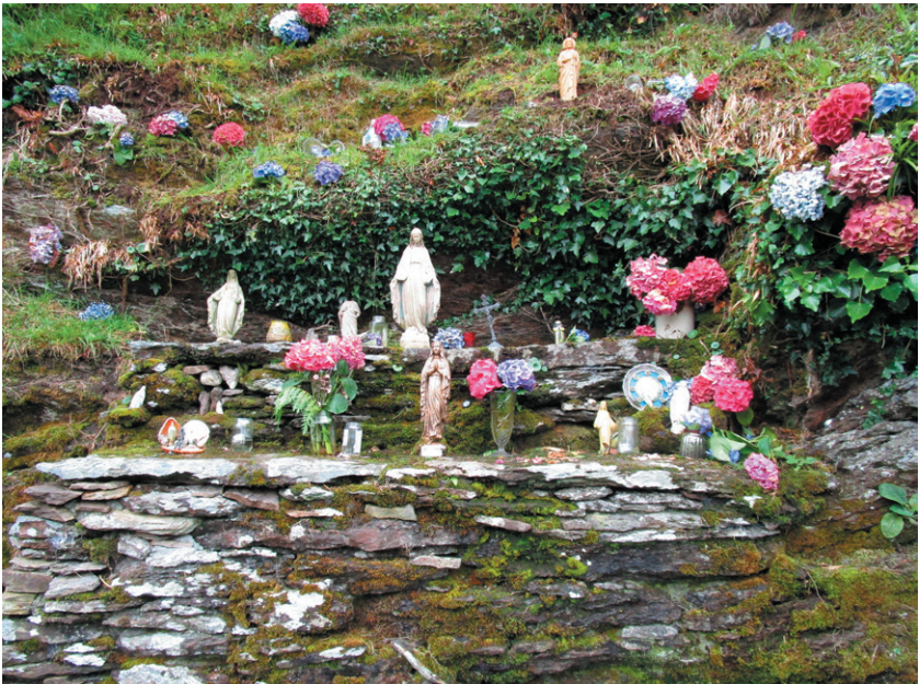
Plate 11 Offerings, Beach Mass Rock, County Cork