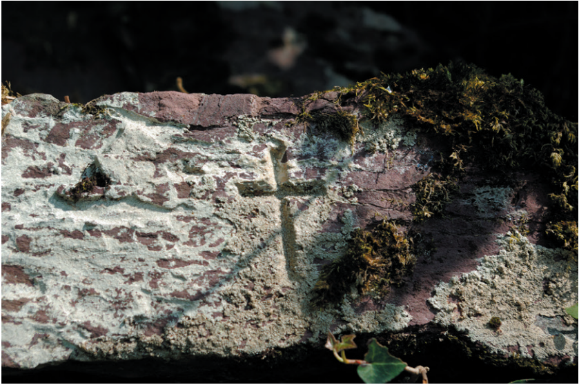
Plate 10 Inscribed Cross, Kilnadur Mass Rock, County Cork