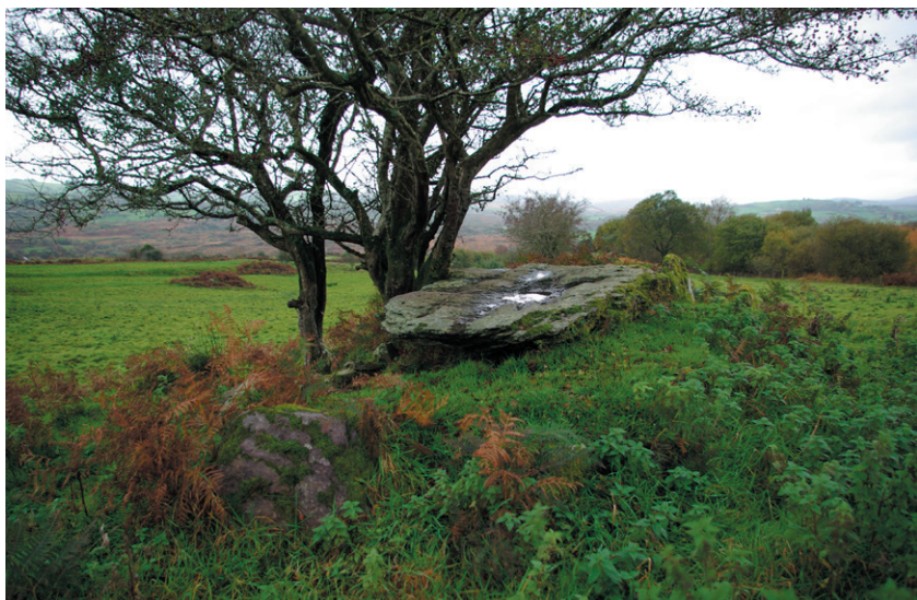
Plate 2 Cooldaniel Mass Rock, County Cork