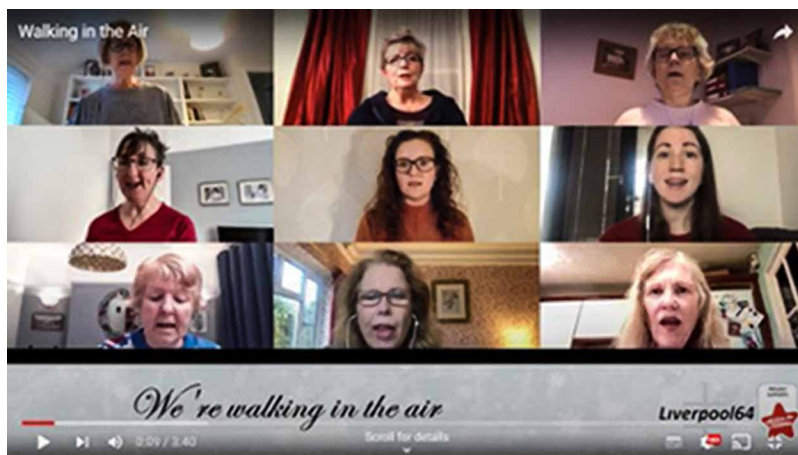
Figure 4: Virtual performance of "Walking in the Air" by LC's Liverpool64 adult choir