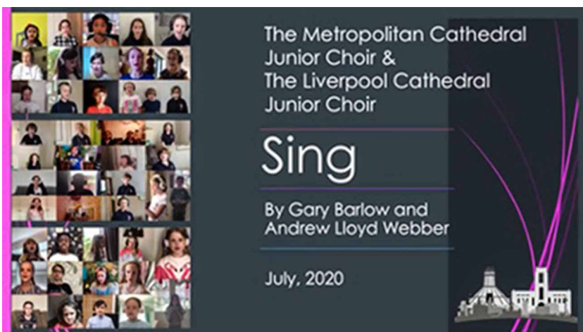
Figure 2: Screen grab (YouTube) for a virtual performance of “Sing” by children of the Junior Choirs at LC and Metropolitan Cathedral