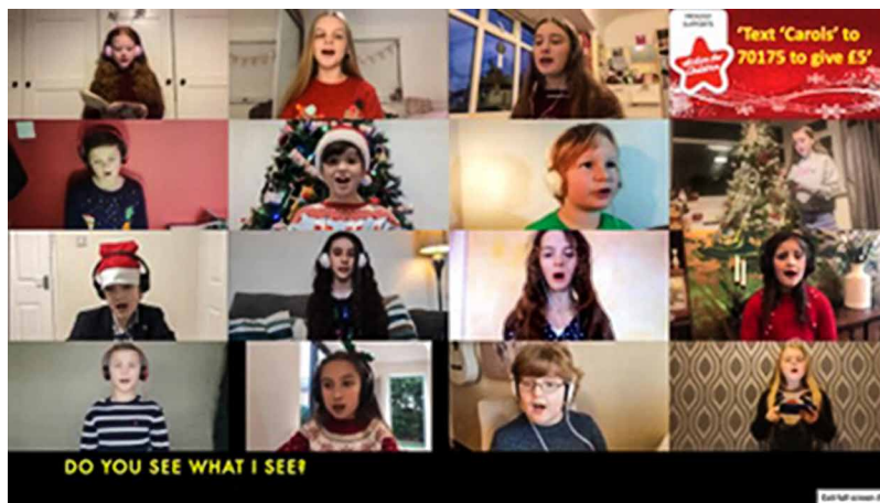
Figure 3: Screenshot of both cathedrals' Junior Choirs performing "Do You See What I See?"

To mark the Christmas season in a "stay-at-home" fashion, the Gilbert Scott Youth Choir presented a virtual rendition of "Calypso Lullaby," while L64 premiered a virtual performance of "Walking in the Air" (see Fig. 4). 35 These performances showcased the singers in their individual home environments. In doing so, LC's virtual presentations introduced innovative and intricate means for participants to interact with one another, leveraging the spatial convergence made possible through video streaming technologies and digital interfaces. 36