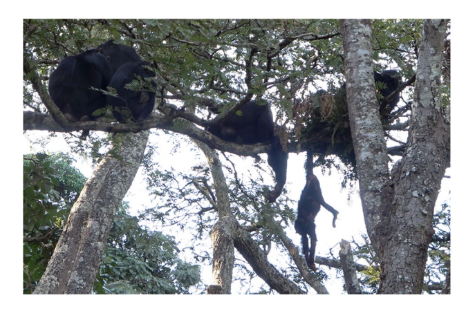
Fig. 2 Adult, adolescent and juvenile males from the attacking party with the infant's carcass shortly after the attack. KIT is in a nest made minutes before by him, holding the infant's carcass (dangling below). WA is showing interest in the carcass but does not take it back from KIT after this point. Screenshot taken from Supplementary video 7 (see Supplementary videos 6 and 7 for nest-making sequence)

09:18 h: The party stopped, and after a quiet pause, began displaying, leaving the carcass and crossing over a