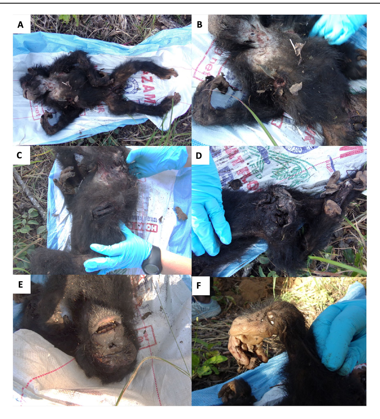
Fig. 3 Post-mortem photos of the injuries incurred by the attacking males on the infant victim during the intercommunity lethal encounter. Injuries incurred include: Broken right femur and tibia (A), removed genitalia (A, B), punctured and lacerated throat and chest