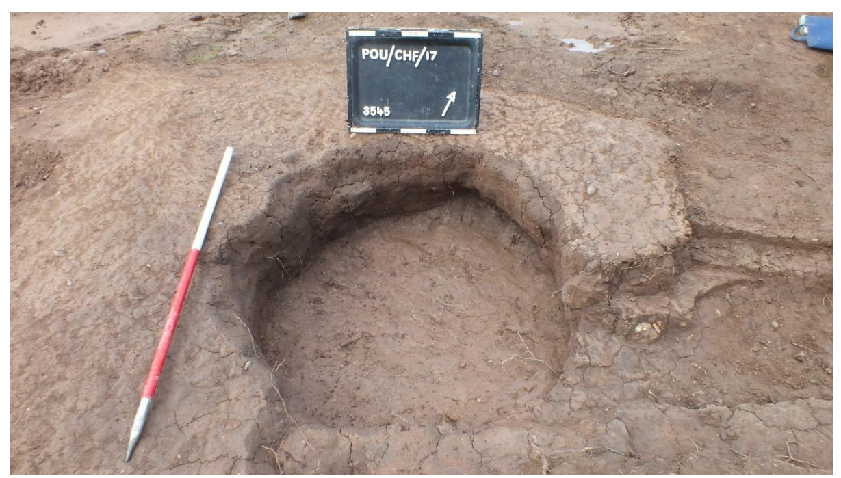
Plate XII: Poulton Chapel and Graveyard: excavated pit.