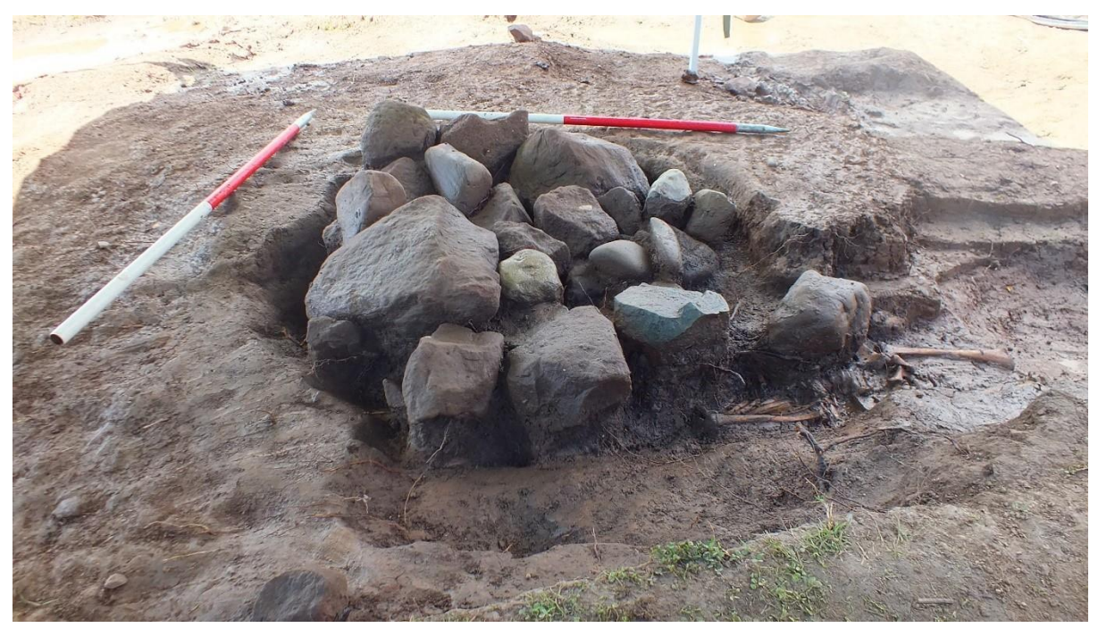
Plate X: Poulton Chapel and Graveyard: stone cap of pit.