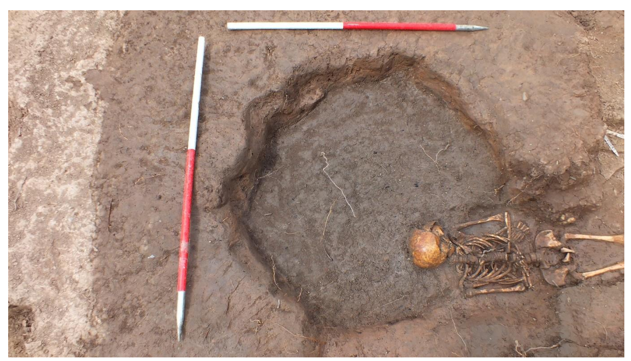
Plate XI: Poulton Chapel and Graveyard: charcoal rich fill with intercutting burial.