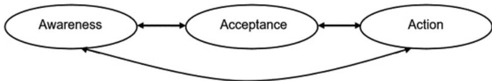
Figure 3: The relationship between the three super-ordinate themes that emerged from the social validation interviews

Although some minor initial intervention barriers were mentioned by different participants, such as the need for commitment, concerns about the application of the intervention during competition (considering these were injured athletes), and some difficulty in the beginning to grasp the mindfulness concept, the intervention enablers highly outweighed the barriers. Positive enablers included increases in awareness, acceptance, positive behaviour changes, and adherence to the rehabilitation programme. Despite some initial scepticism, all of the experimental group participants recommended intervention for athletes, teams, and 'everyday individuals' who are going through a difficult situation in their life or just need some performance-enhancement techniques. One of the participants reported the discovery of a new talent through the intervention and another one expressed how mindfulness helped her do well in an interview and gain employment. The physiotherapists of the athletes reported (to the participants) that they were 'doing very well' and some were even 'ahead in their rehab process'.