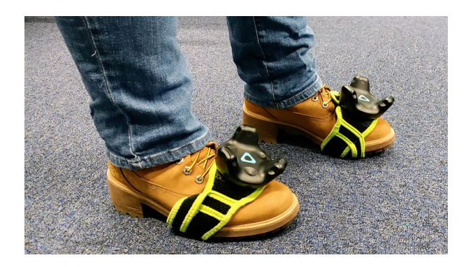
Figure 2. SteamVR trackers applied to feet of participants.

learned to use one-footed movements to test each block in order to identify Crack blocks, which could also be the Fall blocks that they should avoid.