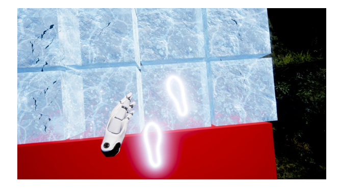
Figure 3. View as solid block is stepped on.

Skin Conductance Level (SCL) was recorded at 2000 Hz via the Bionomadix ambulatory psychophysiology system (BIOPAC). SCL data were collected from the index finger and second digit of the non-dominant hand and