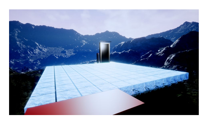
Figure 5. View of environment from starting position (all blocks raised to final height for illustration).