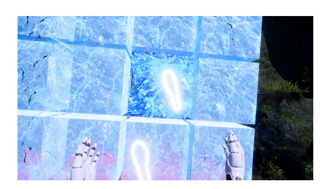
Figure 4. View as crack block is stepped on.