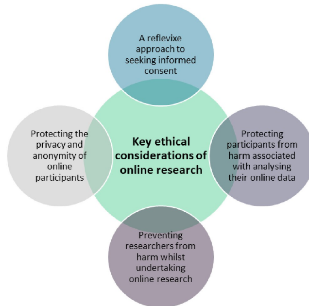
Fig 2. Summary of key themes from guidance on ethical online research.

https://doi.org/10.1371/journal.pone.0302924.g002