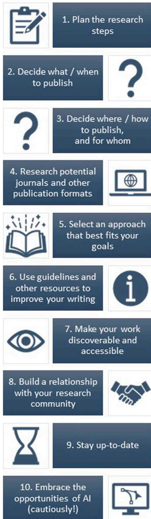
Figure 2. ‘Ten top tips’ in publishing, for early career researchers.