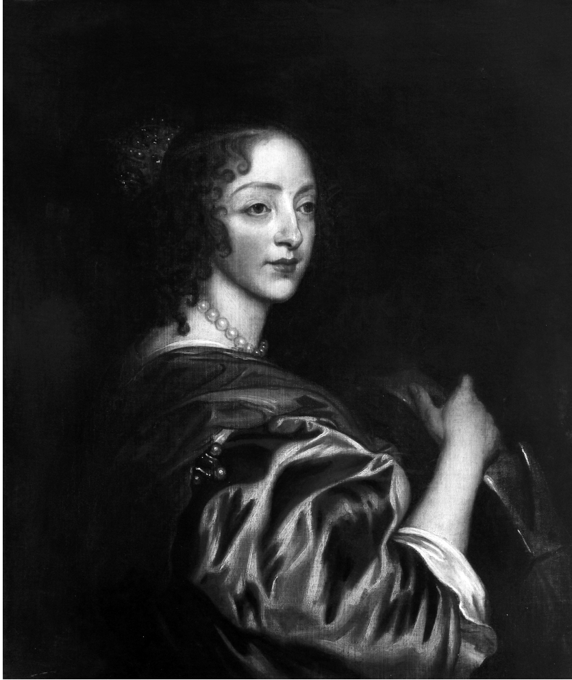
Figure 1. "Queen Henrietta Maria as Saint Catherine" from the studio of Anthony Van Dyck (c.1639).

from Henrietta Maria's elite theatricals, as in the court masque The Temple of Love (1635) by William Davenant and Inigo Jones. Paid for by the queen and performed possibly four times at court, with Henrietta Maria dancing the role of Indamora, The Temple of Love boldly celebrated the queen's success as a Counter-Reformation champion, encapsulating her anticipation of a deeper and permanent revival of the old faith in England. 9 It is little wonder that by the 1640s, Protestant concern regarding Henrietta