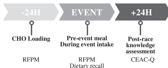
FIGURE 1 Study timeline around competition period (top) assessment of dietary intake and knowledge (bottom). Dietary intake was assessed using the remote food photography method (RFPM) 24 h in the lead-up to competition to assess carbohydrate (CHO) loading and pre-event meal, with the dietary intake during the event assessed with a dietary recall. One day after the event, the knowledge of carbohydrate for competition was assessed using the Carbohydrate for endurance athletes in competition questionnaire (CEAC-Q). Following recruitment, dietary intake was collected over two consecutive days including the day prior to competition (CHO loading) and competition day for pre-event meals and intake during the event (which was recalled immediately after the event). Carbohydrate (CHO) knowledge was assessed using Carbohydrate for endurance athletes in competition questionnaire (CEAC-Q).

This was an observational study conducted in two phases exploring the association between CHO knowledge and practice of endurance athletes during competition through quantitative (current study) and qualitative methods. Knowledge of CHO requirements for competition was assessed using the carbohydrates for endurance athletes in competition (CEAC-Q) (Sampson et al., 2022) which was completed the day after competition, to mitigate the possibility of the questionnaire influencing behaviour. Dietary intake recorded the period around competition during the 24 h prior to the event and the main meal eaten immediately before the event using the remote food photography methodology (RFPM) (Martin et al., 2012; Stables et al., 2021). Due to the impossibility of using RFPM during competition, individuals provided a dietary recall of what was ingested during the race immediately