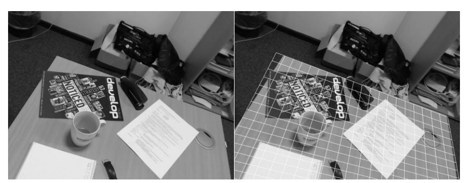
Figure 9. Approximated 2D plane on the scene image without (left) and with (right) using the algorithm. Note the small white line on the right edge of the desk in the left image where the incorrectly estimated plane is.