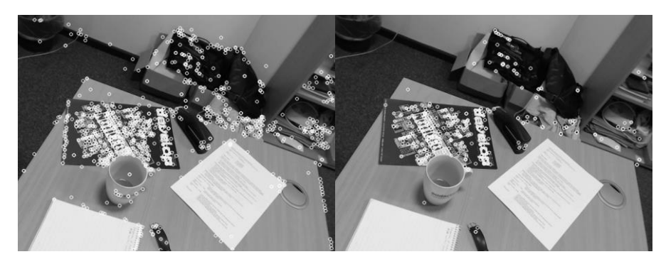
Figure 6. Detected features on the scene image without (left) and with (right) using the algorithm