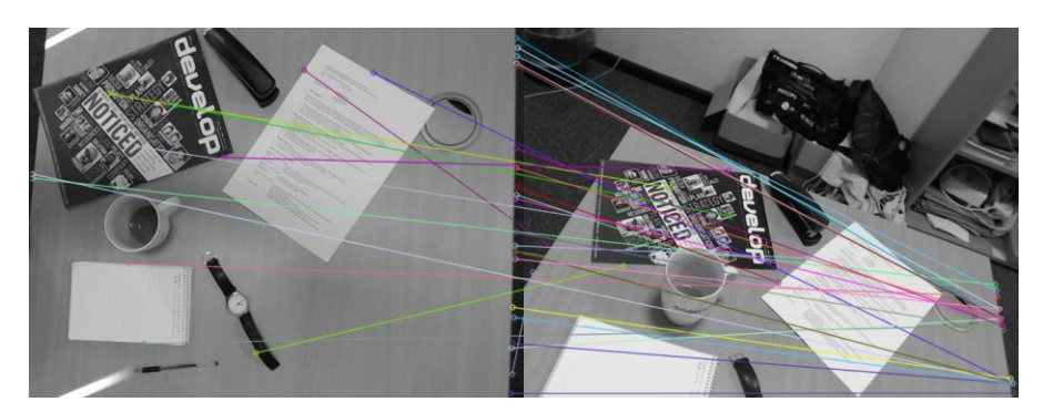
Figure 7. Matched features without the algorithm applied