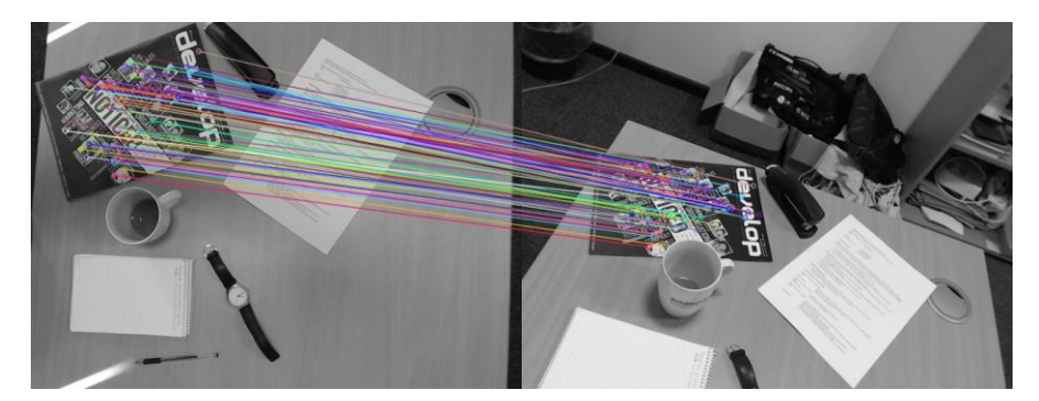
Figure 8. Matched features with the algorithm applied