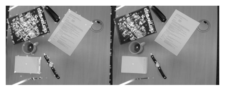
Figure 5. Detected features on the reference image without (left) and with (right) using the algorithm