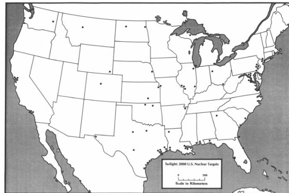
Fig.2: Map of US nuclear targets included in the Howling Wilderness supplement.

A representative selection of maps from the basic game and its supplements help to elucidate this point. Fig.1 shows a section of the map of Poland included with the game's original boxed set, while Fig.2 shows the US nuclear targets map included in the Howling Wilderness supplement. 60 The Poland map offers little in the way of visual information about the effects of war. Towns and cities that have been devastated by nuclear strikes are rendered as clusters of small dots, but beyond that there is little to indicate the impact of war or demonstrate its effects to players through the map. The US map is even more stark and of even less utility. The sites of nuclear strikes are un-named and even states are left blank. The reader is assumed to be able to correlate the un-named dots with a printed list of nuclear targets presented two pages later. Far from enhancing understanding of the world in which play takes place, these maps reduce understanding with the information-free