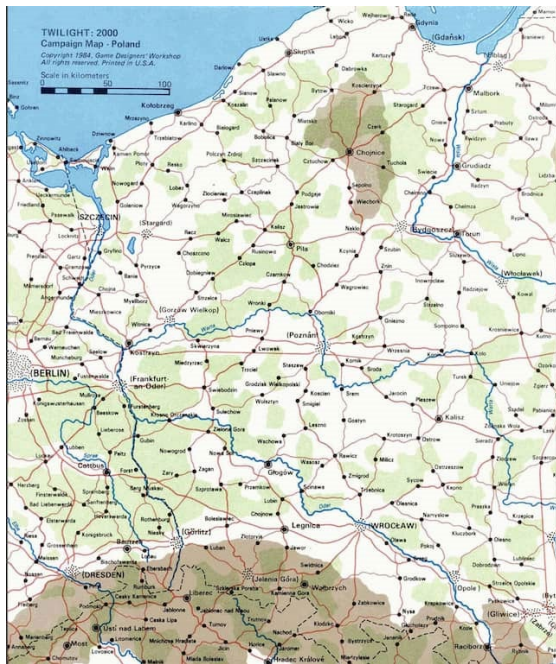
Fig.1: Section of the map of Poland included in the Twilight:2000 1st edition boxed set.

in the extreme, frequently adding to the wider abstracted sanitisation of nuclear war present in the game through what they failed to depict.