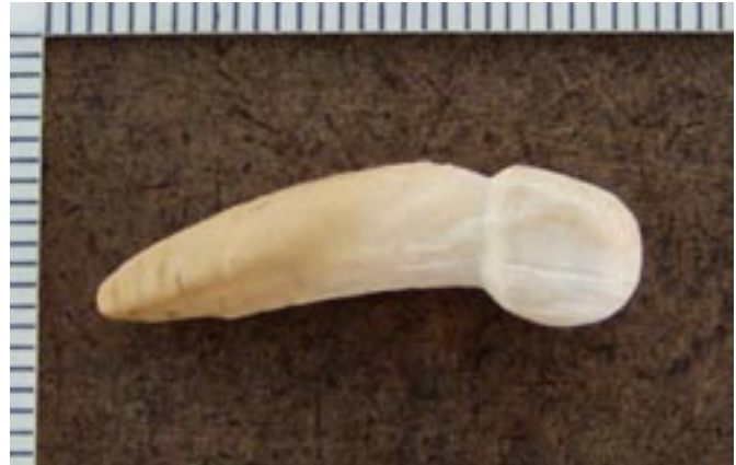
Fig. 3. Mesial view of the carved shell tooth. Tick marks on the margins are 1 millimeter intervals.

al. , n.d.). The other find, a shell fragment carved in the shape of a human tooth, is discussed here.