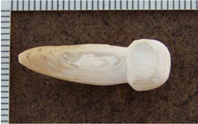
Fig. 2. Lingual view of the carved shell tooth. Note indication of slight shoveling. Tick marks on the margins are 1 millimeter intervals.