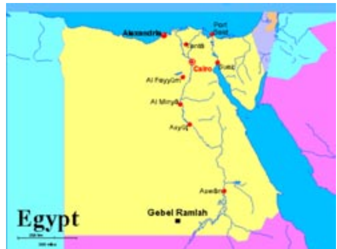
Fig. 1. Location of Gebel Ramlah.