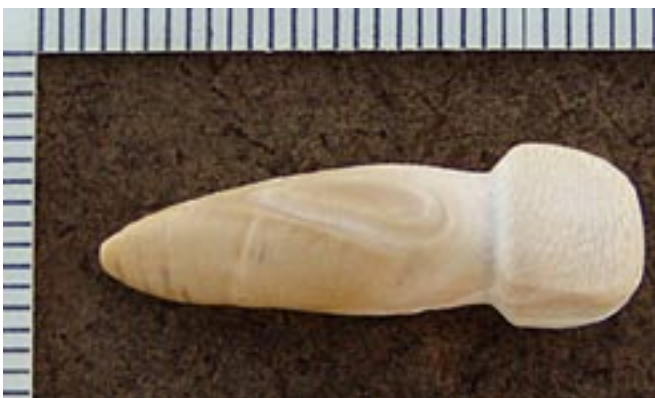
Fig. 4. Labial view of the carved shell tooth. Tick marks on the margins are 1 millimeter intervals.

be derived from the Red Sea; several identifiable shells from this water source were found within intact burials. Although other interpretations are possible (e.g., mini-phallus? ), it is almost certainly a life size rendition of a human maxillary incisor—specifically, a left central or perhaps lateral tooth. As evident in Figures 2 through 5, the object's "morphology" closely corresponds to this determination. Everything from an incisor's large, pointed single root, to its constricted neck and straight incisal edge are skillfully rendered. Moreover, an indication of slight shoveling is detectable on what would be the object's lingual surface (Fig. 2). The lingual and labial (Fig. 4) aspects of the "crown" are similar in appearance to that of a left central incisor. However, the occlusal view (Fig. 5) is suggestive of a more asymmetrical left lateral incisor. Indeed, mesiodistal and buccolingual measurements (using the method of Moorrees, 1957) taken of the object's "crown," 7.7 and