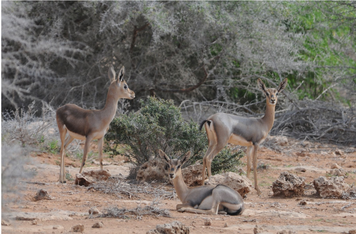
Figure 2. Exemplary group composition of female Farasan gazelles (a female with her last and second last female offspring—i.e., a matriline), resting inside the Acacia grove during the dry season.