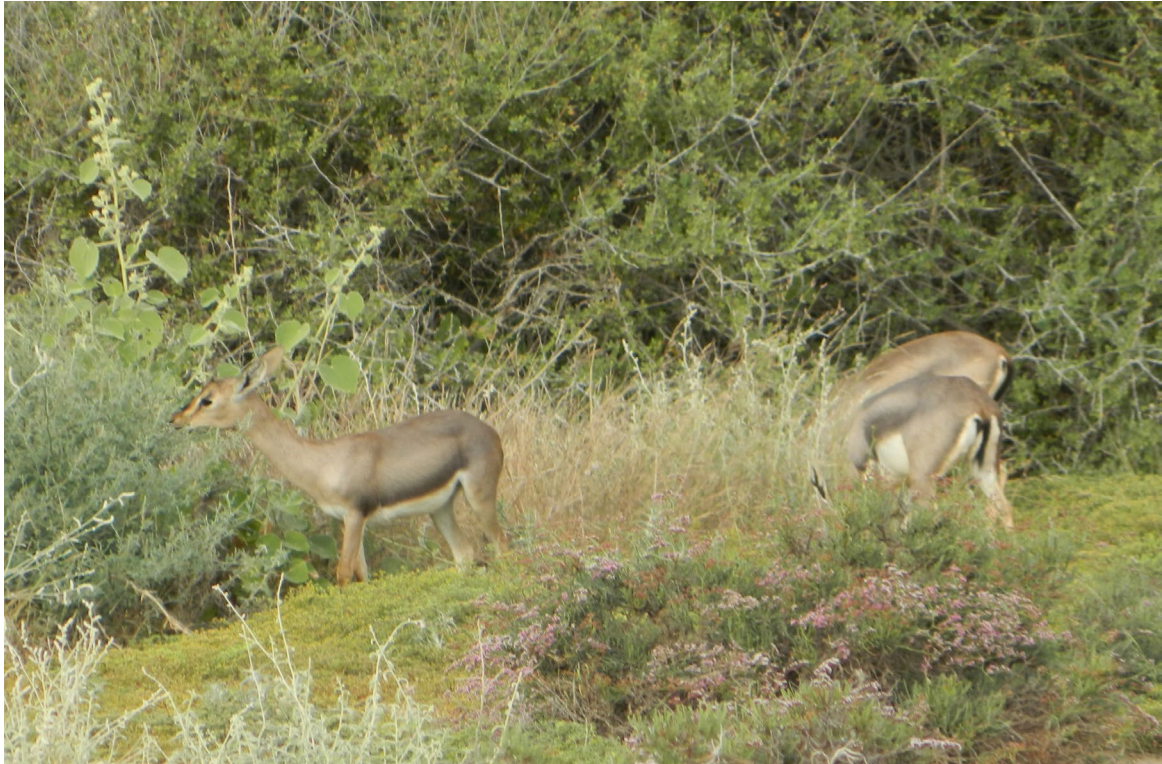
Figure 3. Typical group composition of female Farasan gazelles (a female with her last and second last female offspring), browsing on various herbs during the wet season.