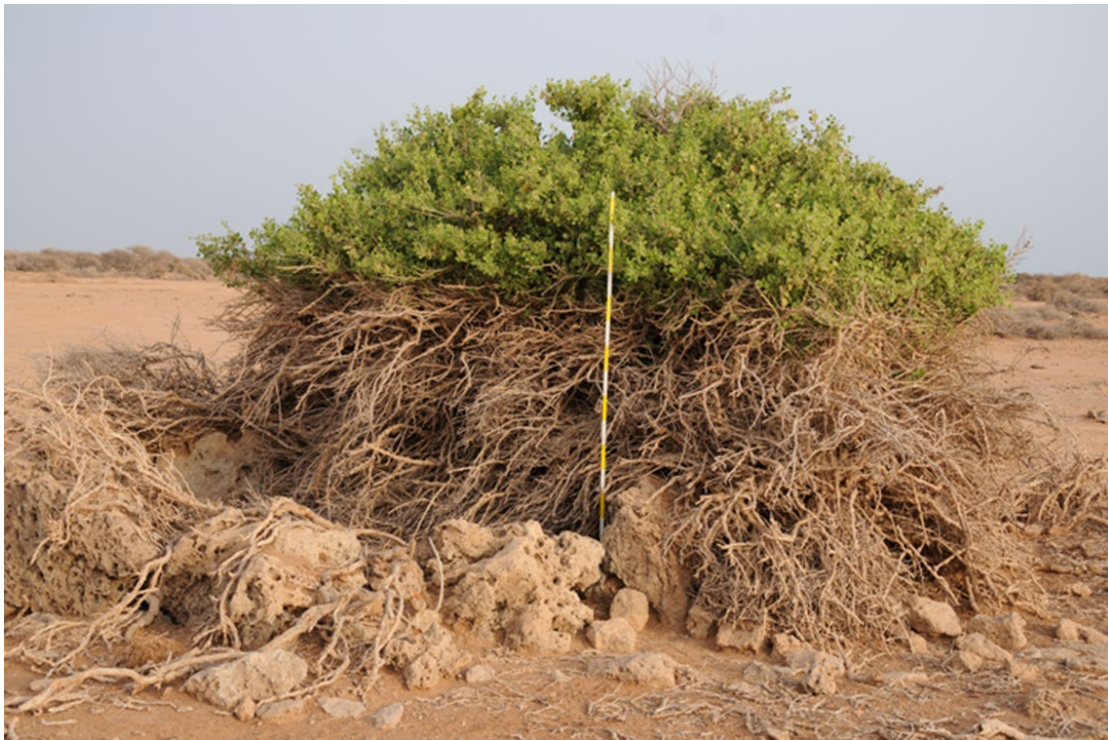
Figure 4. Capparis sinaica Veill. bush, a succulent species containing a high amount of hygroscopic water. The level pole indicates the maximum feeding height of Farasan gazelles (1.4 m).