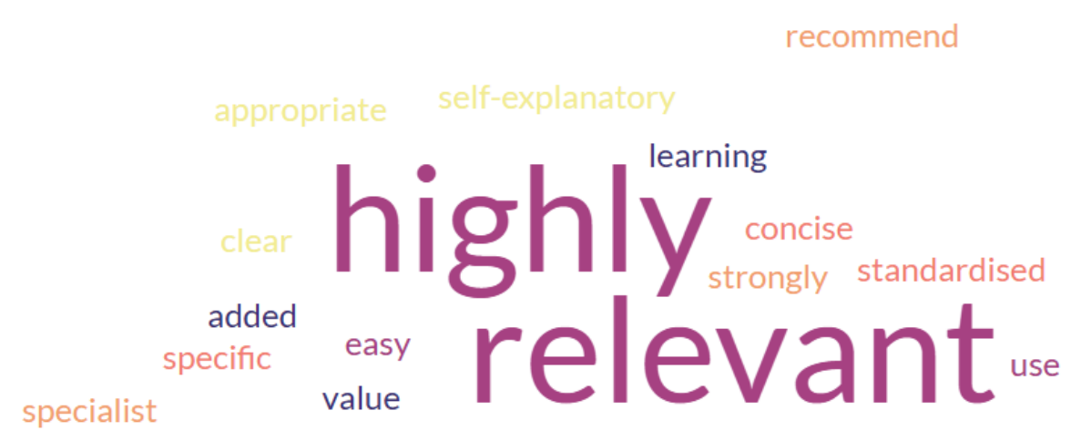
Figure 2 - Supervisor (n=1, response rate 20%) survey responses.