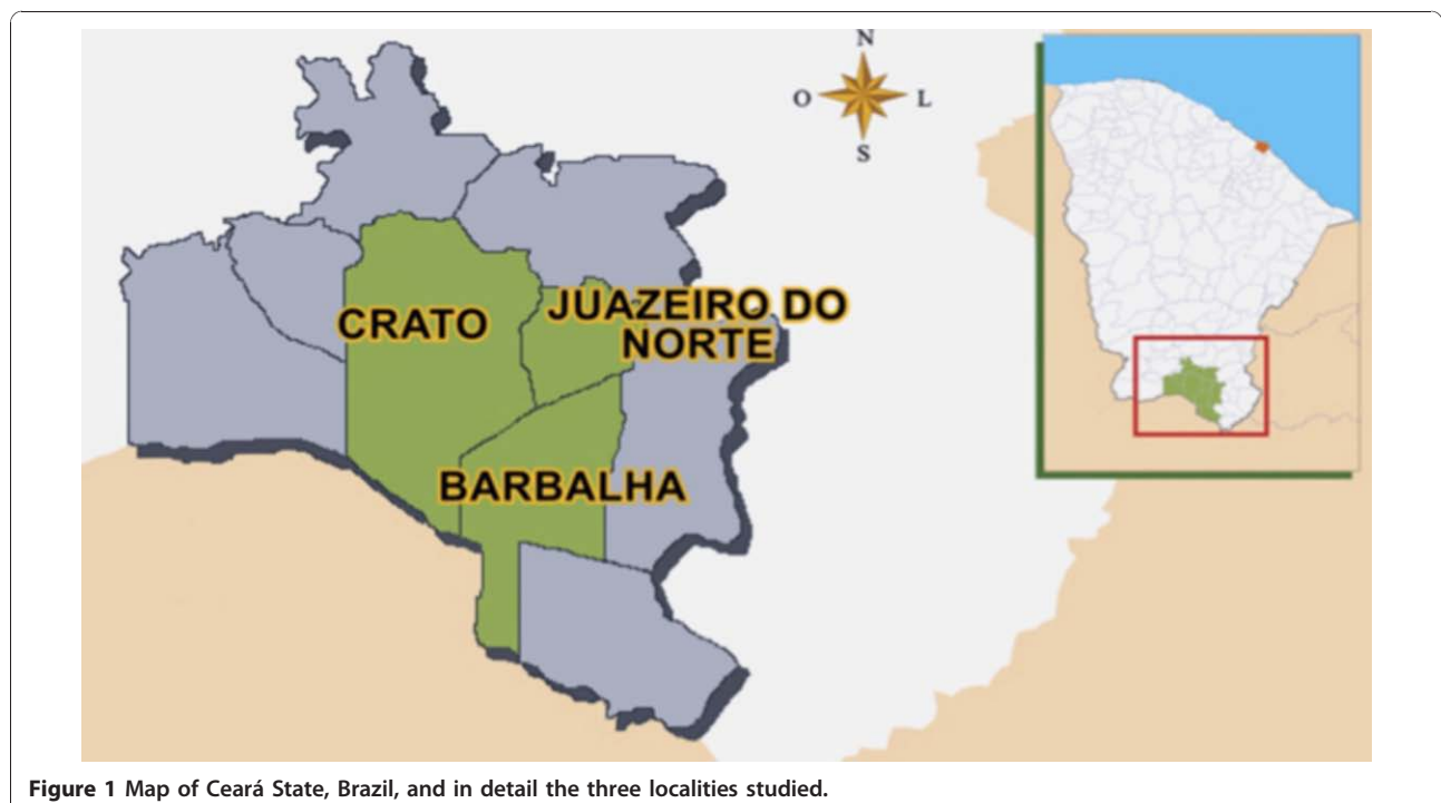
Figure 1 Map of Ceará State, Brazil, and in detail the three localities studied.

Dose-response bioassays were undertaken according to the methodology proposed by the World Health Organization to evaluate larval susceptibility to temephos [36]. In these experiments, third-instar larvae (L3) were