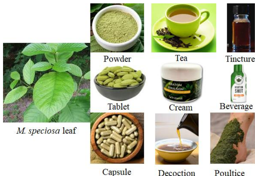
Figure 3. Different formulations of Mitragyna speciosa leaf containing mitragynine.