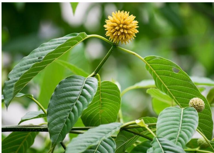
Figure 2. Mitragyna speciosa (Korth.) Havil., the main source of mitragynine.