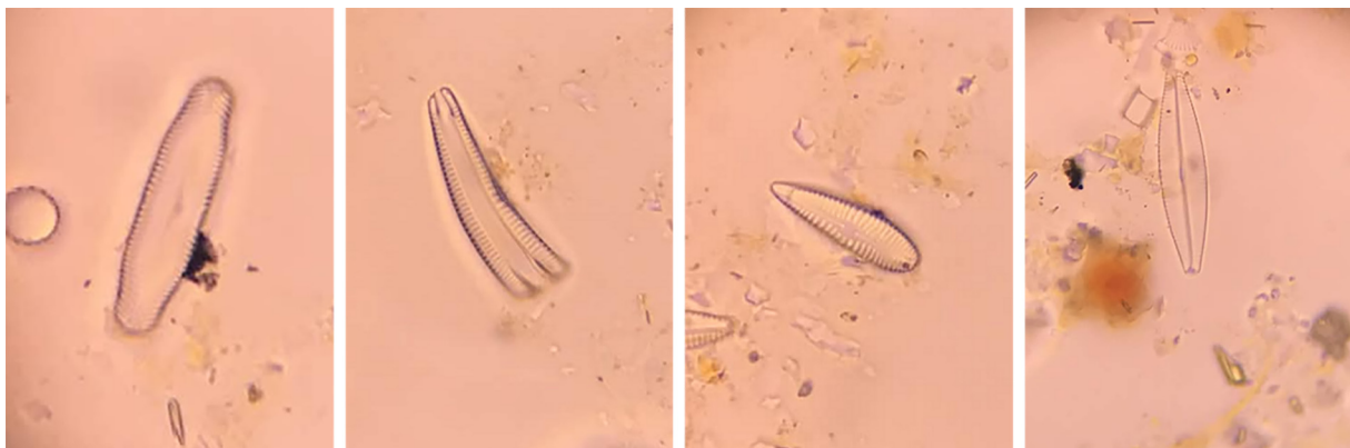
Figure 1. Examples of different diatom structures from a single sample under the microscope

Diatoms offer a striking example (Figure 1). These microscopic algae vary dramatically between aquatic environments, making them useful for geolocation. Their presence in lung tissue can also help determine whether someone drowned, depending on whether they entered passively post-mortem or through active aspiration. The same principle applies to bacteria and fungi: soil microbiomes differ so distinctly across locations that soil from a shoe or tyre can be matched to a specific environment.