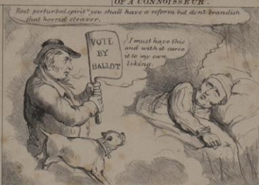
AWFULL VISION WHICH APPEARS TO EARL G-Y AFTER EVERY PUBLIC MEETING.