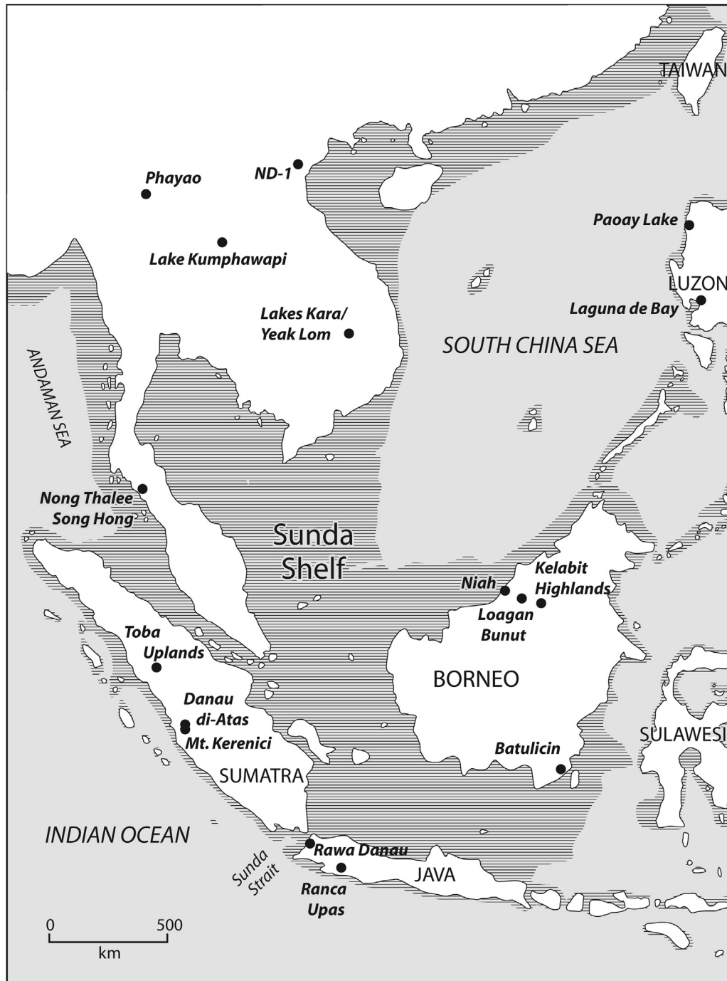
Fig. 1. Location of Early Holocene sites reviewed in Table 1 .

(Bellwood and Renfrew, 2002; Bellwood, 2005). One powerful example of the application of European-influenced Neolithic models has been the ‘Austronesian Hypothesis’ (e.g. Bellwood, 1985, 1988, 1997, 2005, 2011; Diamond, 2001; Diamond and Bellwood, 2003; Spriggs, 2011) where apparently convergent linguistic and archaeological evidence was interpreted to indicate a diaspora of Austronesian-speaking, rice-growing agricultural people from Taiwan some 5000 years ago. These people are argued to have spread across many of the islands of the Sunda Shelf – the great archipelago of Island Southeast Asia (Fig. 1), acquiring tree crops and losing rice on the way, before dispersing further to