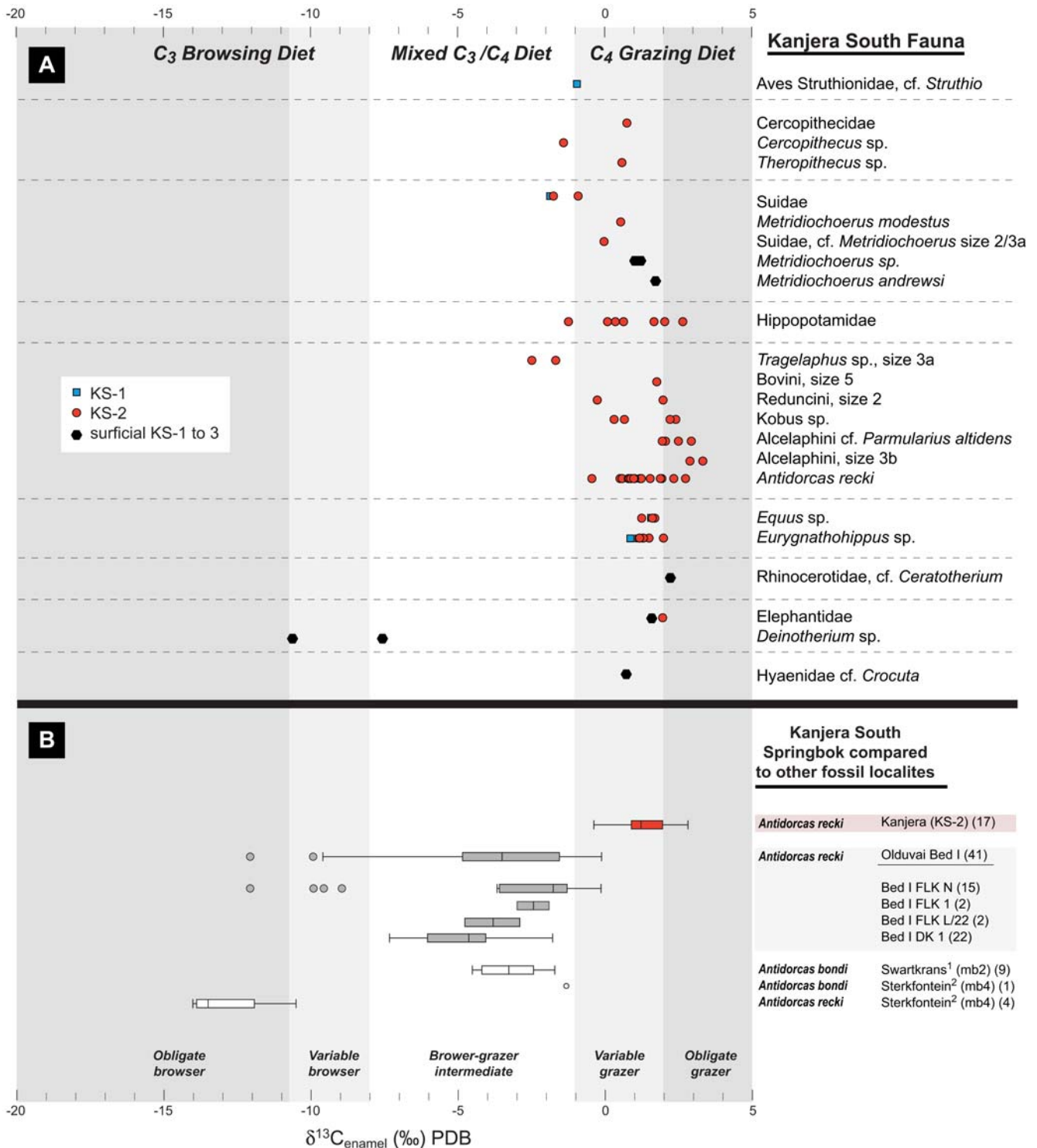
Figure 3. Stable carbon isotopic data of enamel from Kanjera South and other African localities. A. Stable carbon isotopic composition of fossil mammal tooth enamel from KS-2 in Excavation 1. The KS-2 fauna is supplemented by several taxa unique to KS-1 or KS-3, or found on the surface of the KS-1 to KS-3 sequence, to provide a more complete sense of the diet of the mammalian community during the deposition of the archeological levels. The shading reflects the relative importance of C 3 browse versus C 4 grass in the diet, with \delta^{13}\text{C} values greater than -1 reflecting a diet with more than 75% C 4 vegetation. Isotopic dietary classification follows others [23]. A probable ostrich (cf. Struthio ) eggshell fragment was also analyzed. B. Box and whiskers plots of the stable carbon isotopic composition of modern and fossil gazelles from Kanjera, Bed I Olduvai Gorge, Tanzania, and Sterkfontein and Swartkrans, South Africa [60,61]. Like many modern antilopines, Antidorcas recki was able to switch between browse and graze as necessary [9]. Numbers in parentheses after site name represent number of samples analyzed. Bed I localities are presented in stratigraphic order, from oldest (DK I, ~1.87 Ma) to youngest (FLK NI, ~1.78 Ma) [3]. doi:10.1371/journal.pone.0007199.g003