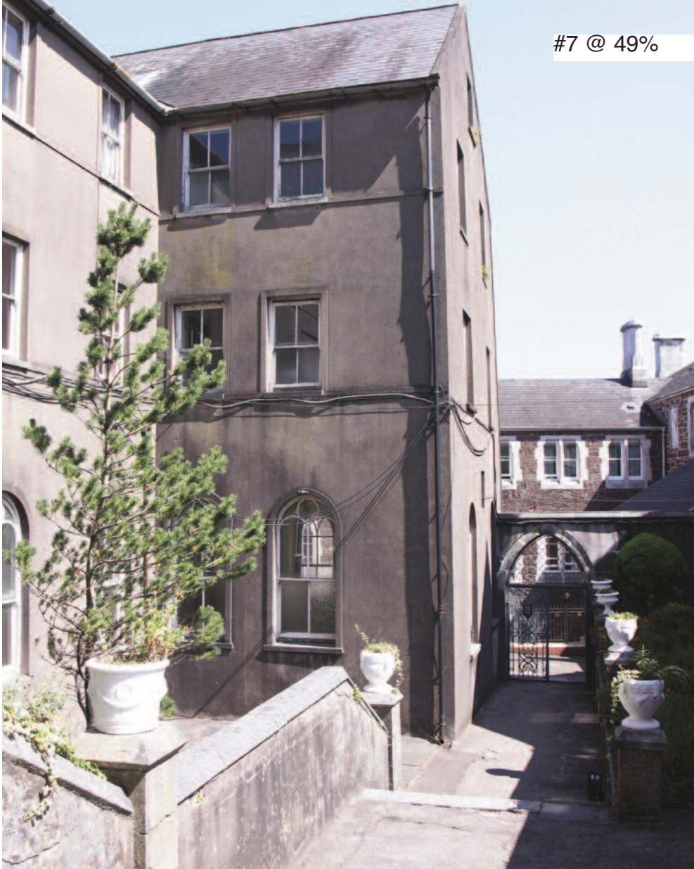
7 – Steps leading from the convent building down to Douglas Street The characteristic changes of level and profusion of steps result from the steeply inclined site.

opposite 6 – Exterior of the South Presentation Convent showing the front (north) elevation of the original convent building built by Nano Nagle for the Ursuline Sisters The extensions to both sides were added later by the Ursulines to accommodate their expanding numbers.