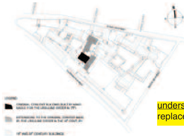
13 – Site plan of the South Presentation Convent indicating the surviving eighteenth-century convent buildings. (courtesy JCA Architects)

The Ursulines flourished in Cork. In January 1772 they opened their school and took in twelve boarders. 41 The convent too began to thrive. Wealthy Catholics were pleased to see their daughters enter the convent, and the size of Nagle's original building quickly proved inadequate. The Ursuline Annals for 1772 record that 'toward the close of this year, a large addition was begun to be built to the first house — or, rather, a sec-