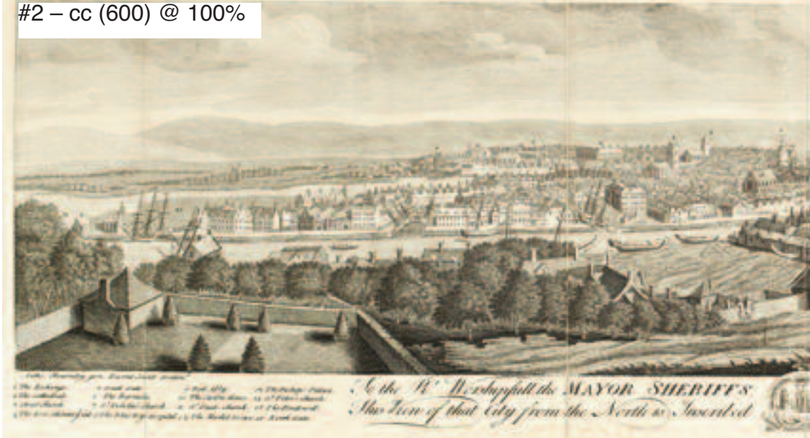
2 – Thomas Chambers, engraving of Cork, 1750

published in Charles Smith, HISTORY OF THE COUNTY AND CITY OF CORK (Cork, 1750)