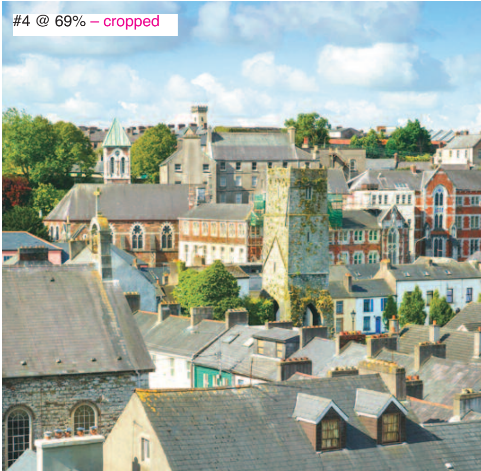
4 – Present-day view of the South Presentation Convent, from the north, with its associated sandstone chapel and former alms house, and red-brick school building. The tower of the former Augustinian Friary and the eighteenth-century South Chapel can be seen in the foreground.