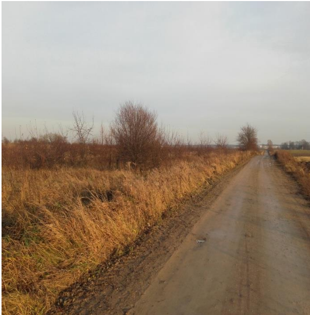
Fig 5. The analysed land plot in 02-04-2016—the abandoned territory

In the case under investigation, the objects of visual pollution are the unattended vegetation. The analysed territories have been visited twice and during that period some individuals (40 %) tidied their land plots, so the landscape has changed again (Fig. 5-6.).