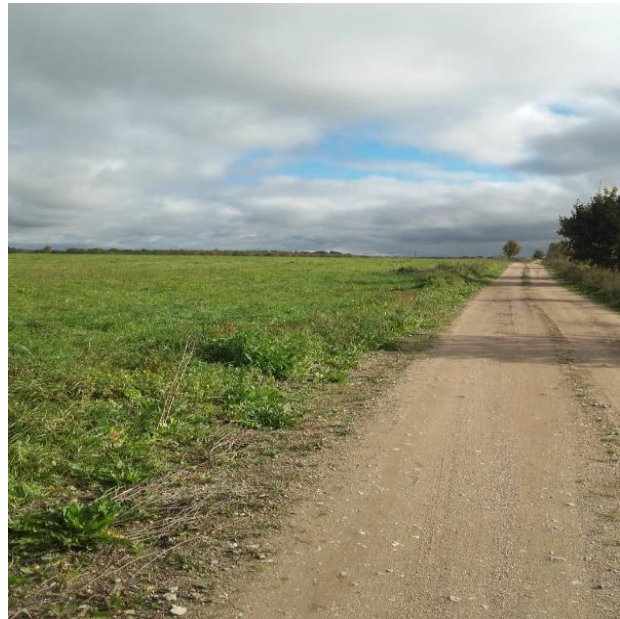
Fig. 6. The analysed land plot in 02-09-2016 –already cleaned-up territory

The aesthetic image is more enjoyable when the area is not abandoned and not covered with stiff, low value plants. A more detailed evaluation of the selected panoramic photographs (7-8), where the abandoned (B) and the cleaned-up (A) territories are separated. As mentioned before, there are various methods of evaluation, this time the simple descriptive evaluation is selected (Table 4-5).