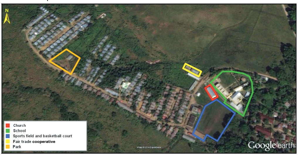
Example 1 of Community Spaces Identified As Important in Villa Ascension de Caraballo, Dominican Republic