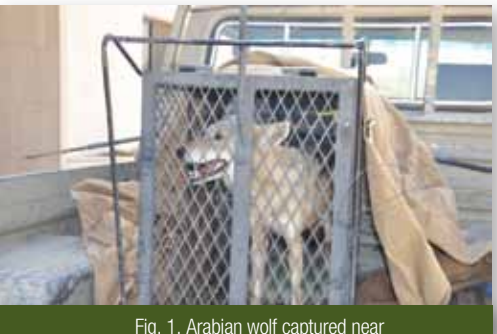
Fig. 1. Arabian wolf captured near Janadriyah north of Riyadh in central Saudi Arabia.

Introduction: The Arabian wolf ( Canis lupus pallipes ) on the Arabian Peninsula is in decline occupying approximately 75% of its former range, with an estimated total number of 500 and 600 animals on the peninsula (Mech & Boitani 2004). Detailed numbers for Saudi Arabia are not available. Wolves are not protected in Saudi Arabia and are subject to heavy prosecution (Cunningham et al. 2009). Their protection in the Kingdom is difficult since the species is considered the nemesis of Bedouins since time immemorial. Although not yet endangered the survival of wolves is a serious concern and its long-term survival may be only possible in large protected areas with good populations of wildlife (Gasparetti et al. 1985). More recently Cunningham & Wronski (2010a, b) reported that Arabian wolves still occur over vast parts of Saudi Arabia, probably in larger numbers than previously assumed.