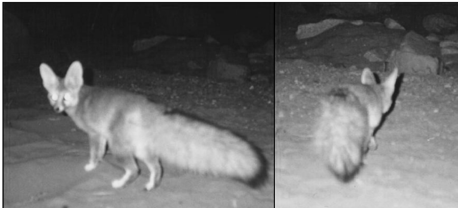
Figure 2a,b. Blanford's fox photographed in the At-Tubaiq Protected Area in northern Saudi Arabia (Wacher 2001).

The Blanford's fox sighting from the At-Tubaiq Protected Area in northern Saudi Arabia falls within the suspected range as