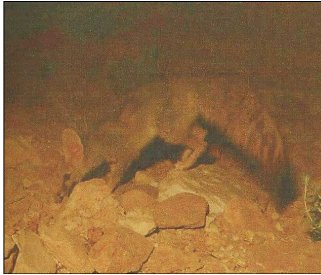
Figure 3. Blanford's fox photographed in the Ibx Reserve in central Saudi Arabia (Attum 2004).

indicated by Geffen et al. (2004) – i.e. the western mountainous region of Saudi Arabia – and Ginsberg and MacDonald (1990) – i.e. suitable habitat. However, the Blanford's fox sighting from the Ibx Reserve is viewed as a range extension from its known range in the Asir Mountains in south-western Saudi Arabia eastwards to central Saudi Arabia, a distance of approximately 800km inland (400km from the Arabian Gulf). The closest other confirmed sightings (except for the At-Tubaiq Protected Area individual – this report) are from the Jebal Samhan (Dofar region) area north of Salalah in southern Oman (Harrison and Bates 1991; Spalton and Willis 1999) and the limestone inselberg – Jebal Hafit – in south-eastern United Arab Emirates (Drew 2003) as well as other mountainous wadis in the UAE (Stuart and Stuart 1995; Cunningham and Howarth 2002), all these areas approximately 1,000km away, respectively. These last mentioned areas are separated from the Tuwaiq Mountains by the Rub al Khali or Empty Quarter, the largest inland sand sea in the world thus denying potential movement of Blanford's fox between the Tuwaiq Mountains eastwards and southwards.