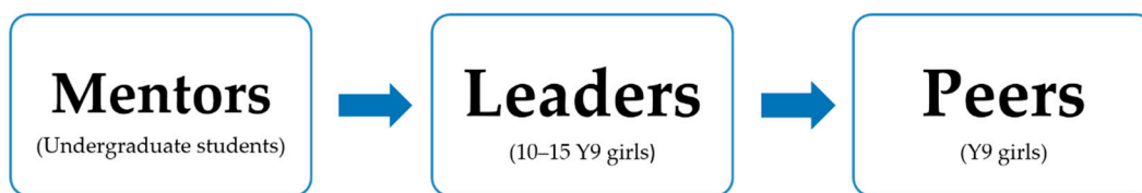
Figure 1. The intended direction of knowledge transfer from Mentors to Leaders to Peers.