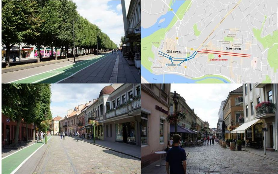
Figure 1: Kaunas city: Vilniaus street and Laisvės avenue

The research was carried out applying the analysis of secondary data and synthesis research methods.